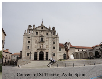
Convent of St Therese, Avila, Spain