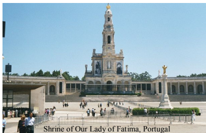
Shrine of Our Lady of Fatima, Portugal