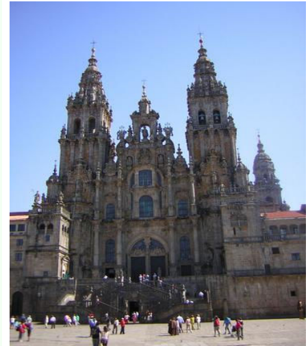
Santiago de Compostela