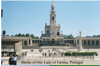
Shrine of Our Lady of Fatima, Portugal