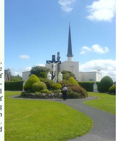
Our Lady of Knock, Queen of Ireland Basilica.

DAY 12 RETURN HOME Breakfast at Hotel. Check out. Transfer to Shannon Airport for return journey home.