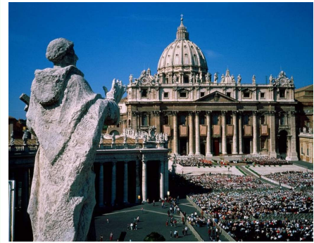
St. Peter's Basilica, Vatican City

DAY 13 MEDJUGORJE - USA Early morning departure to the airport, arriving back home in the evening.